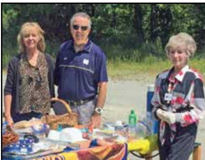
Had a wonderful time at the St. Vincent DePaul picnic.