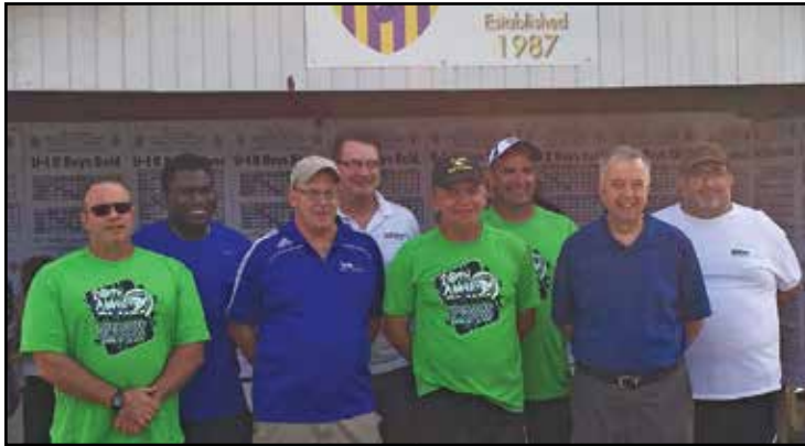
Had a blast catching some of the action at the annual Plum Area Soccer Kick-Off Classic. 20 years and still going strong!