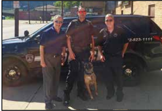
Enjoyed the North Versailles Fire Parade!