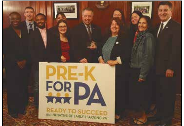
Honored to be named a Pre-K 4 PA Champion! High quality Pre-K & other early childhood development programs are one of the most important investments we can make. Funding these programs ensured a successful future for Pennsylvania residents of all ages.