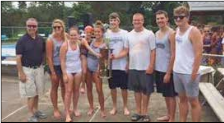
Enjoyed visiting with the Garden City Swim Club, hosts of the 48th annual Monroeville Invitational Swim Meet. Congratulations to all the participants!