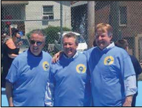
A great time was had by all at the East McKeesport Open Streets Day!